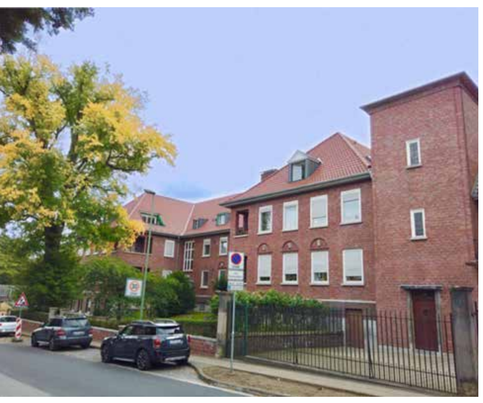
The listed building in Bielefeld