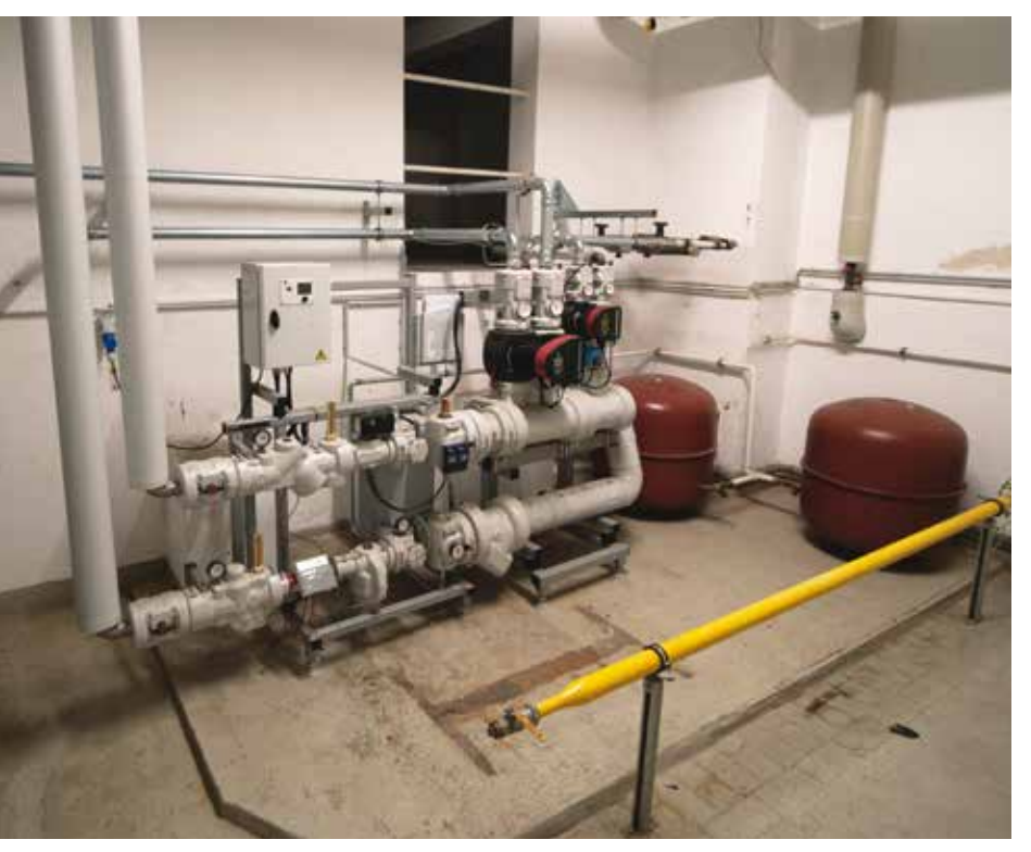
The ewers plant in the old coal cellar of the building