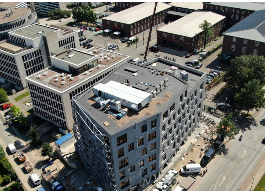
Lenkwerk No. 1 under construction