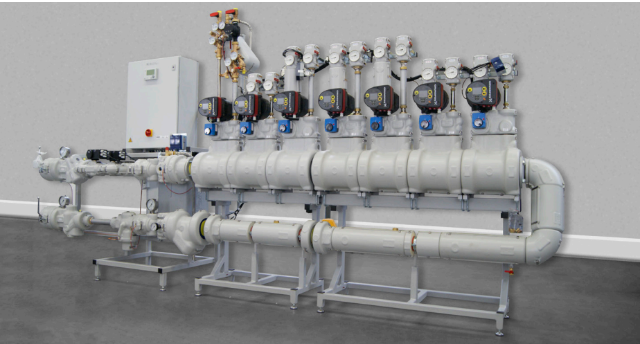
The ewers station for district heating transfer