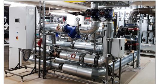
ewers station in the boiler room of the hospital