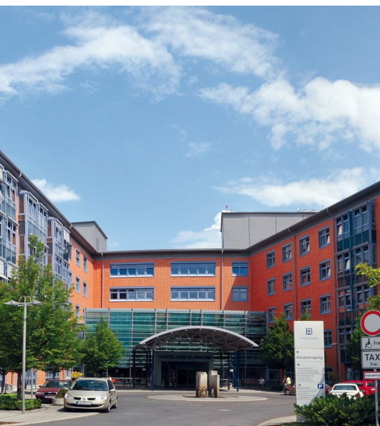
Hufeland Clinical Center

If you have any questions, please feel free to contact us at any time.