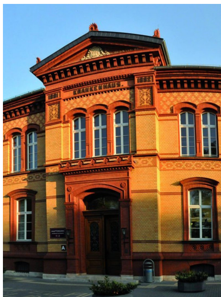
Hufeland Clinical Center