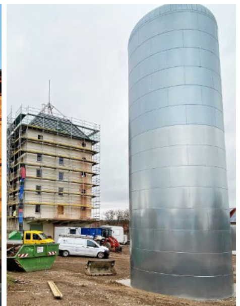
Construction cogeneration plant