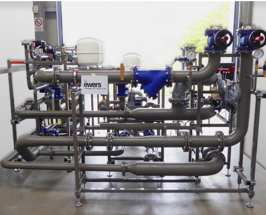
The ewers district heating transfer station