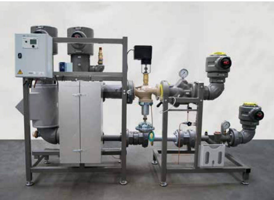
The ewers Station for district heating