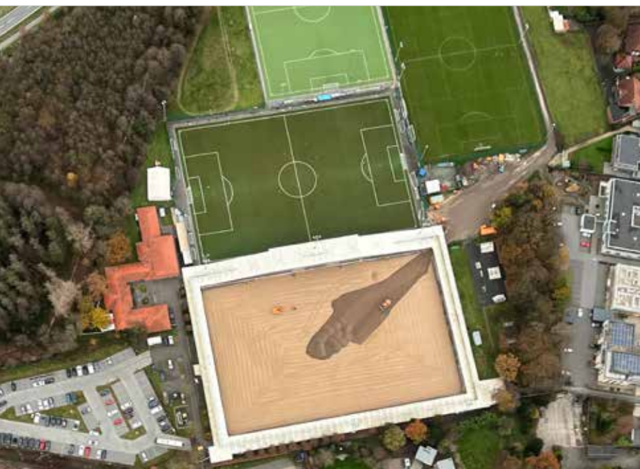
Sports Club Arena in Verl

If you have any questions, please do not hesitate to us at any time.