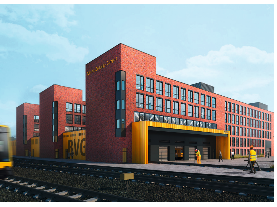
BVG Training Campus