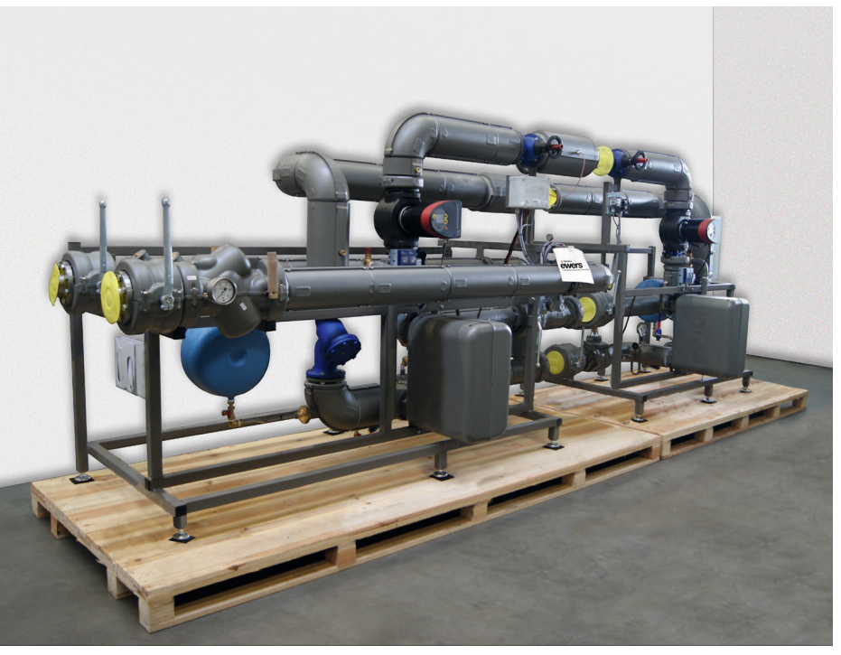
The ewers station for district heat transfer