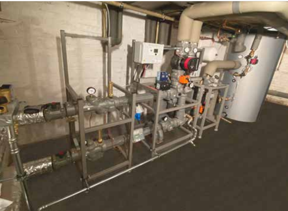
er.1 Frame station for district heating transfer with et.2 Storage charging system