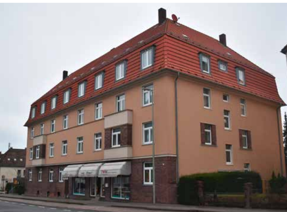
Residential building Bielefeld Jöllenbeckerstraße

If you have any questions, please do not hesitate to contact us.