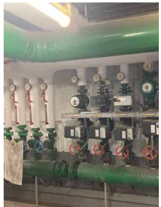
The old gas heating system was replaced.