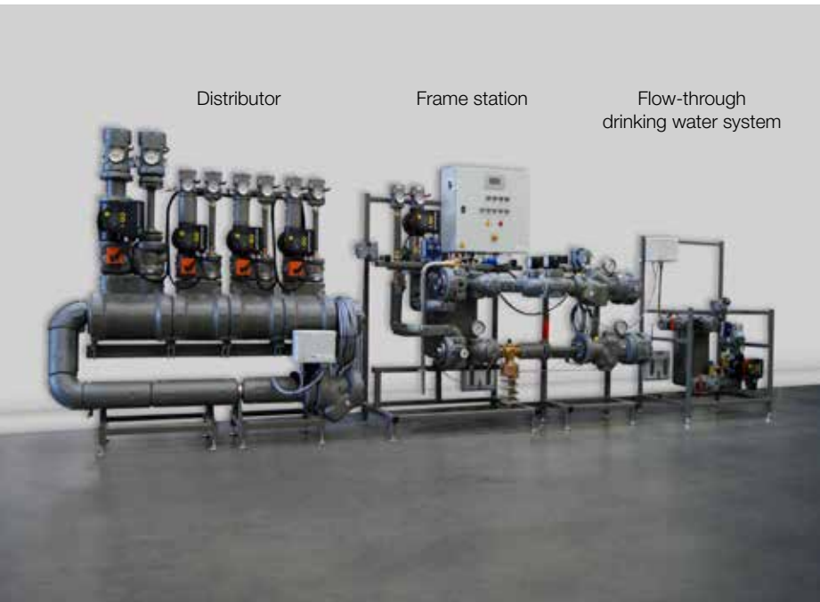
The ewers solution: A modern district heating transfer station with distributor for four heating circuits and flow-through drinking water system