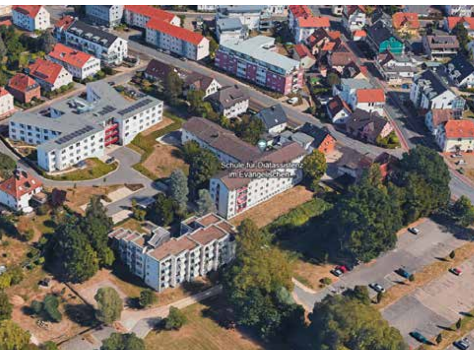
School for Dietary Assistance at the Protestant Hospital Bethel (EvKB)

If you have any questions, please do not hesitate to contact us.