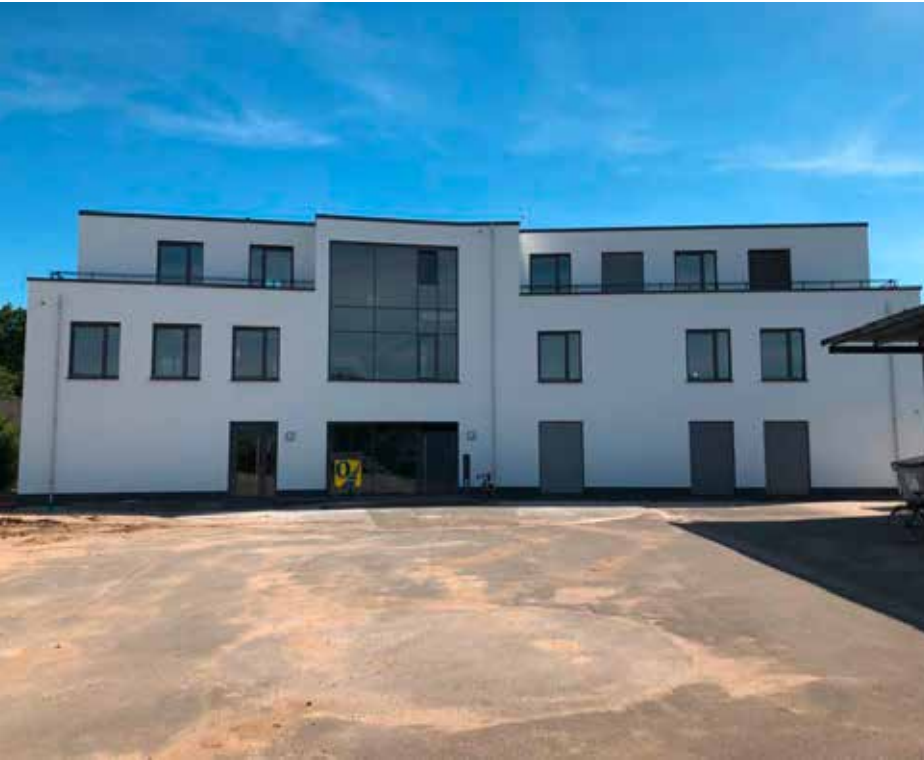
The building of the OEVERMANN Hochbau GmbH in Gütersloh