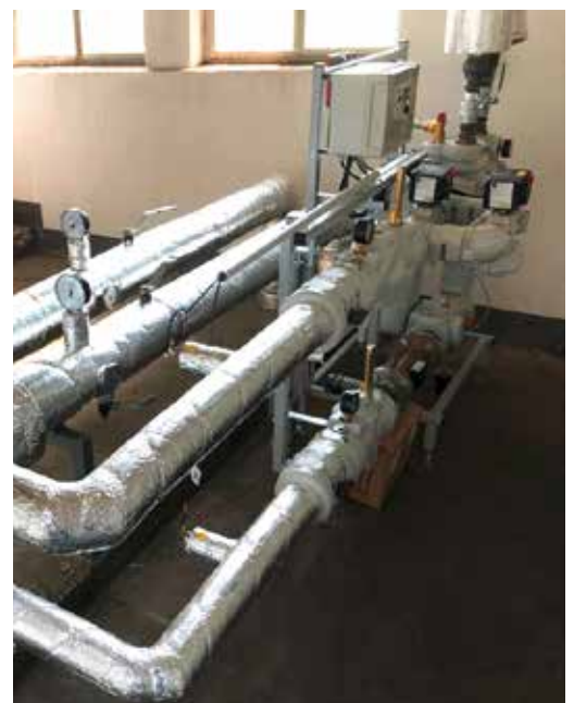
Station for district heating transfer