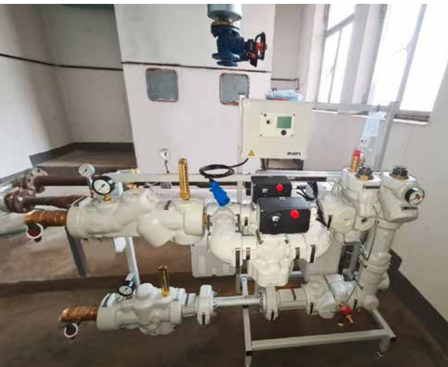
Station for district heating transfer

If you have any questions, please do not hesitate to contact us.