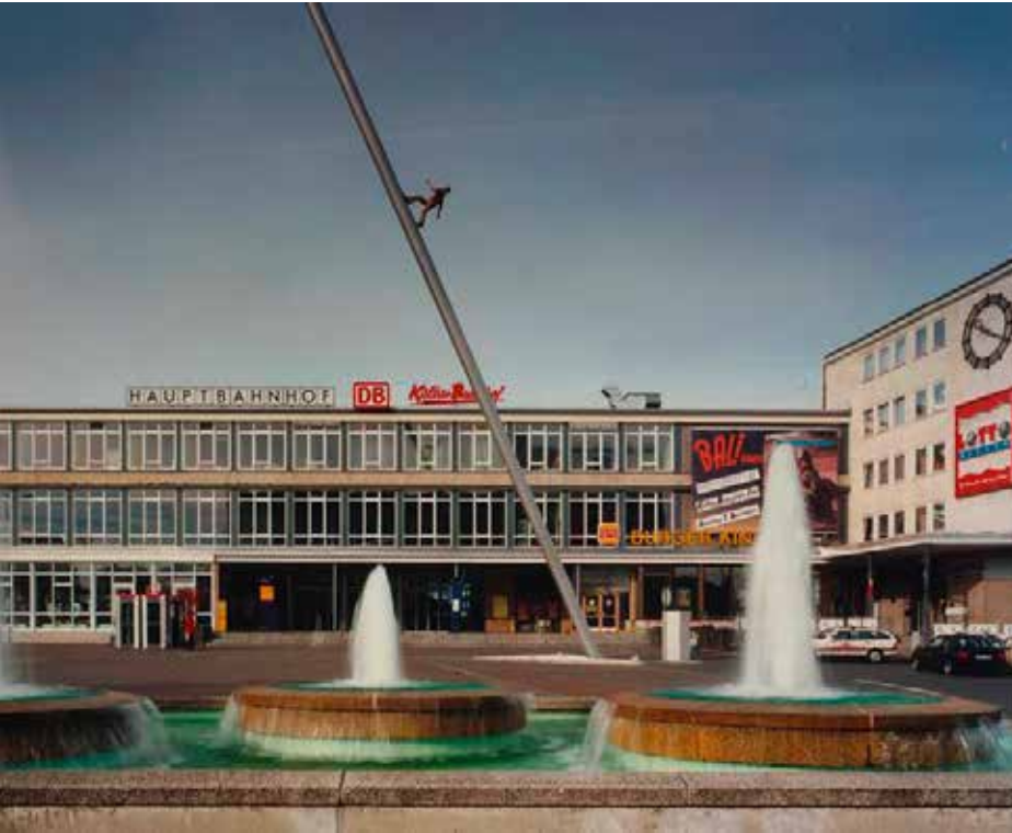
Kassel Central Station and Cultural Station