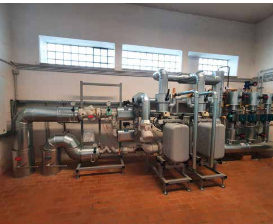
Station for district heating transfer

If you have any questions, please do not hesitate to contact us.